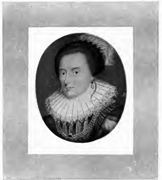
THE QUEEN OF BOHEMIA BY ISAAC OLIVER